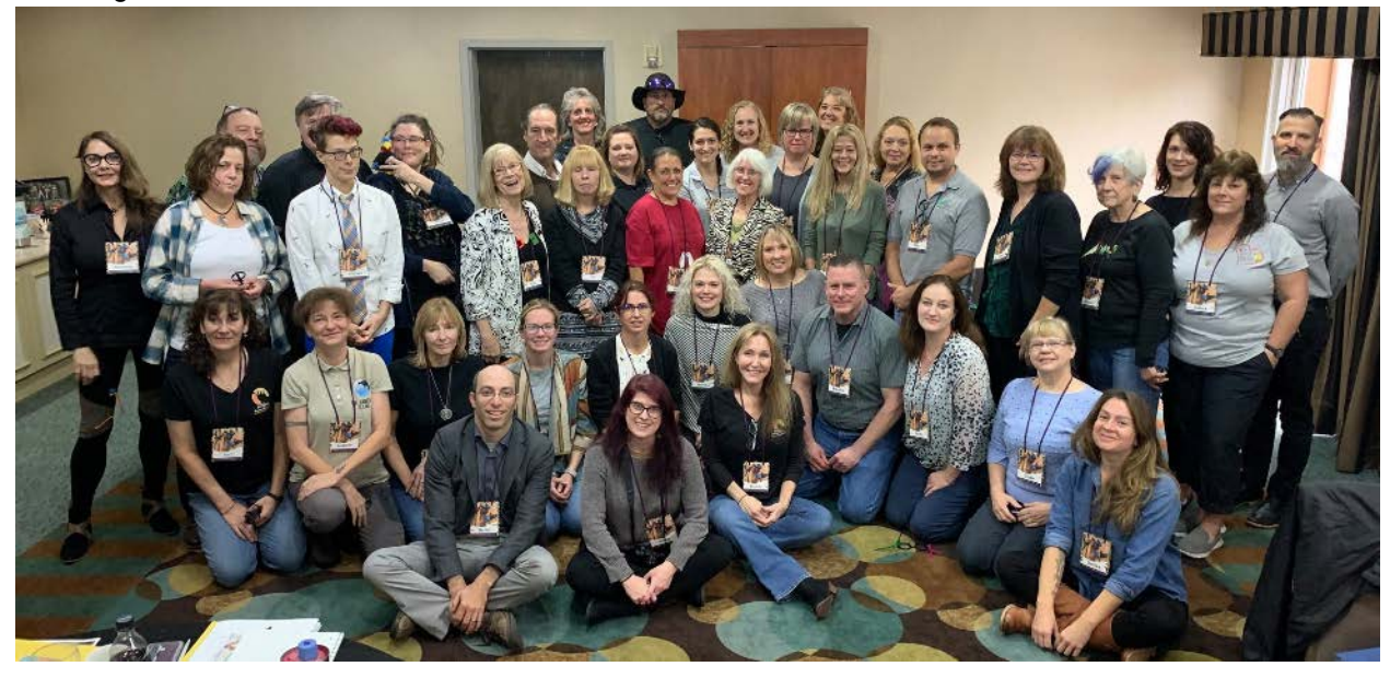
This photo was taken at the start of the conference, featuring all the attendees and speakers. The event included forty amazing individuals, all respected and established members of the avian rescue and sanctuary community across North America – and beyond.